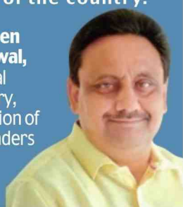
— Praveen Khandelwal , General Secretary, Confederation of All India Traders

M UCH-needed doles provided in the Union budget are likely to drive consumption. This is a positive sign for the nation's restaurant sector. Single-window clearance for the domestic cinema sector manifests the ease of doing business. Why do we still require 15-odd licences to serve a sandwich?